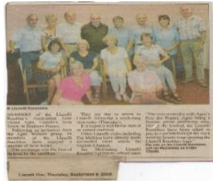
Article from the archives