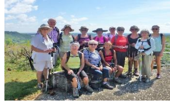
Visitors from Agen