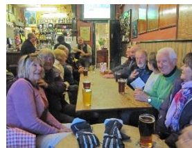
Llanwrtyd Beer Festival