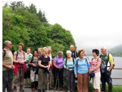
Pontsticill Festival Walk 2012