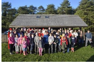
Santa Trail 2013