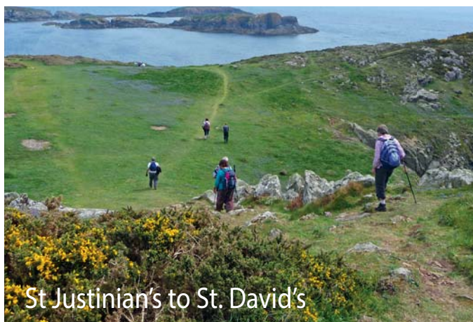
St Justinian's to St. David's

The traditional Welsh tea and social gathering is in the Catholic Hall, Waunlanyrafon, Llanelli (backing onto the Leisure Centre).