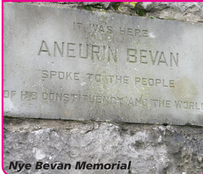
Nye Bevan Memorial